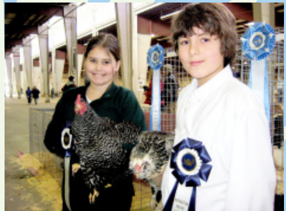
2008 Northeastern Poultry Congress Junior Winners !

In the open Junior class (this is kid bird vs. kid bird). The Congress is offering cool Best of Breed Medals for classes of 10 and up. For winning Junior Class Champions we will be awarding Big Honker Rosettes ! The cream of the crop top birds will be winning Gorgeous Silver Trophy belt buckles . These stunning keepsakes will be offered to the Champion Jr Bantam, Champ Jr Waterfowl, Champ Jr Largefowl, and another one for the