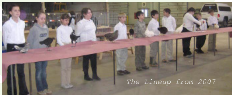
The Lineup from 2007

For kids staying at the Clarion Saturday night there will be a special Junior Social hour. It's a Pizza Party for you kids ! Please come with the intention of meeting new friends and talking chickens just like us