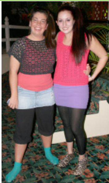
Juniors Having fun at hotel

bring your work with you to the show. A Plaque will be awarded for Club Display and Rosettes to 6th place for individuals. Also new is the Congress Poster Contest . This one is great for you graphic designers out there. Show us